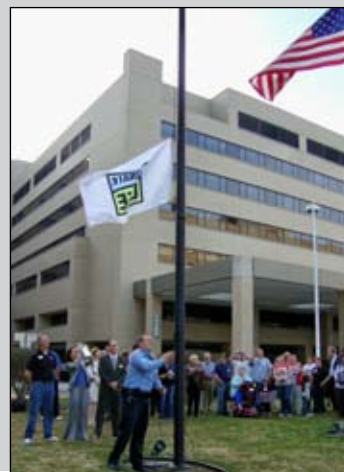
Donor family members, hospital staff and members of Gift of Life Michigan gather on April 1 to raise the Donate Life flag outside William Beaumont Hospital in Royal Oak.

The hospital raised its Donate Life flag, purchased by the Michigan Health & Hospital Association, immediately after the ceremony.